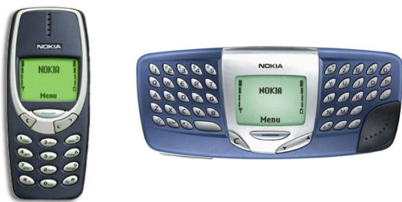
Figure 2. The Nokia 3310 and 5510

We conducted a series of usability tests employing each of the two techniques above to test the usability of two different mobile phones. In each test, the user solved a number of tasks using one of the two mobile phones.