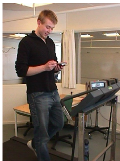
Figure 1. Test subject walking on a treadmill in the usability laboratory

We conducted a series of usability tests employing each of the six techniques above. In each test, the user solved a number of specified tasks using a mobile system. The first five techniques were employed in a usability laboratory. The sixth technique was employed in the field.