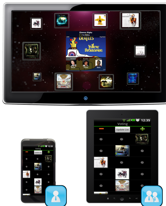
Figure 1: The interaction devices of MEET.

Nominations are represented on the situated display as an album cover which are mapped to the mobile devices. On the situated display the current score is represented by size, meaning that the largest nominations are more likely to be played next. The voting interface is shown in Figure 1.