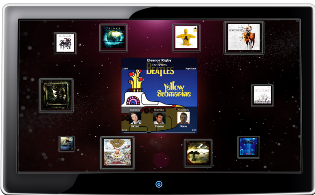
Figure 2: The situated display depicts the current state of the system.

The user interface of MEET is distributed across several devices and thereby to several users. The situated display serves as the only common output device for the player and although it does have an additional part of the user interface on a small screen, this is primarily used for connecting users to the system. All input happens through the handheld devices. Output concerning individual actions, such as keeping track of personal nominations and votes, is provided directly on the handheld device and the current state of the system is summed up on the situated display (see Figure 2).