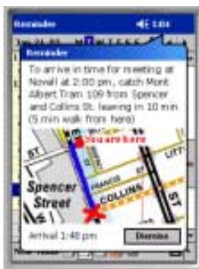
Figures: 3, 4, and 5

directions toward the nearest tram stop. This screen also outlines the full route plan [Fig. 4].