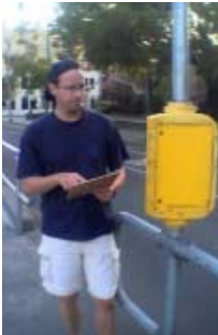
Figure 2: Acting out a future scenario of catching a tram, assisted by a handheld computer (a piece of wood).