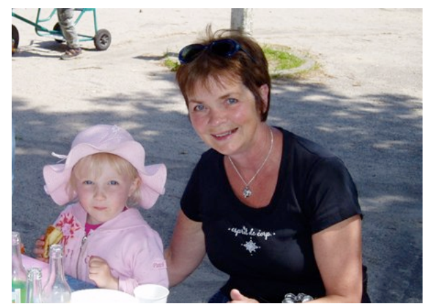
Figure 6. Example of a picture showing family members together. "It is nice here, [Name] was starving".

normally did with them, but due to his absence, he could only see the picture (see Figure 6 and 9 as examples).