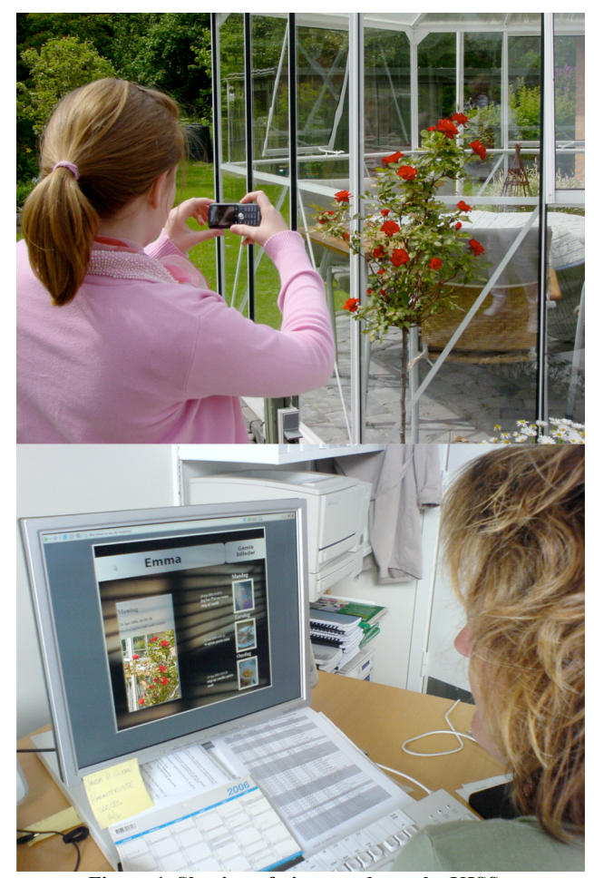
Figure 1. Sharing of pictures through eKISS.

We designed eKISS as a mobile picture blog. The system consists of a website that handles pictures and texts sent from the children to eKISS by sorting them according to the date and time they are sent and presenting them to the users in a structured way. Every family has their own personal weblog only accessible by members of the family.