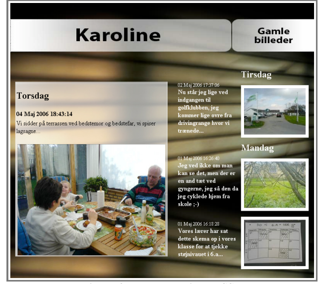
Figure 3. Front page in eKISS.

If the parents click on one of the small pictures, a popup window will display the picture in its original size. The text saying 'Gamle billeder' (top right in Figure 3) is a link to a second page which displays all previously sent pictures in chronologic order (illustrated in Figure 4). An example cut of this page is shown below.