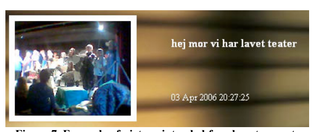
Figure 7. Example of picture intended for absent parent. The note says, "Hi mom, we have been doing theatre".

In most cases, the parents have only used the system while they were separated from their children. This was both at work during the day and at home in the evenings. We expected eKISS to be a part of the conversation that the children and parents had when they saw each other at the end of the day. One reason for the missing involvement of eKISS could be that they are often doing other things that prevent them from using a computer while talking. For example, most of the families talk about their day while eating dinner together. This situation makes it difficult to use eKISS since it requires a computer with internet access. Furthermore, the parents might not feel the need to see pictures of their children while they are with them.