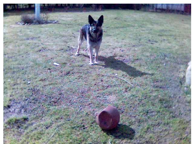
Figure 10. Example of picture that disclosed feelings.

Another example from the same family was that they had to give up their dog because they were moving. One day the boy had taken a picture of the dog and a football (see Figure 10). He had written a note saying that he had gone home to play football with the dog. This showed the parents that he was more upset about giving up the dog than they had known.