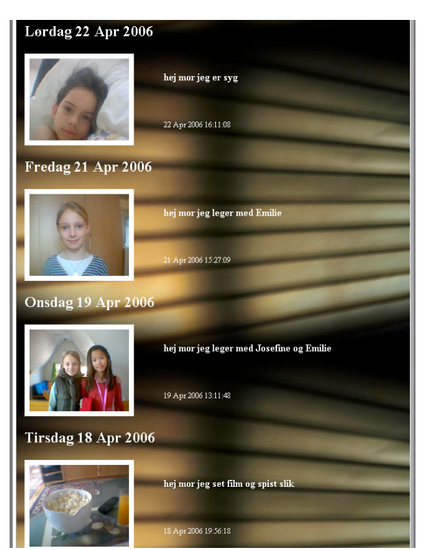
Figure 4. Segment of the list of old pictures in eKISS.

The design of eKISS yields for the parents to ask the children about the pictures they have taken. This provides the children with attention from their parent, and this attention can function as a motivator for the children. To make self-disclosure possible when the children wanted it, and not only when the parents information, we the communication made asynchronous. This was done by storing information sent to eKISS and making it always available and accessible. In this way, the parents would be able to access the information when they have the time and need. It will also be possible to recall the information and use it again in different contexts. This also means that the interaction patterns will both be less intrusive in the daily routines of work and leisure and accommodate the unstructured and non-routine behaviour of children.