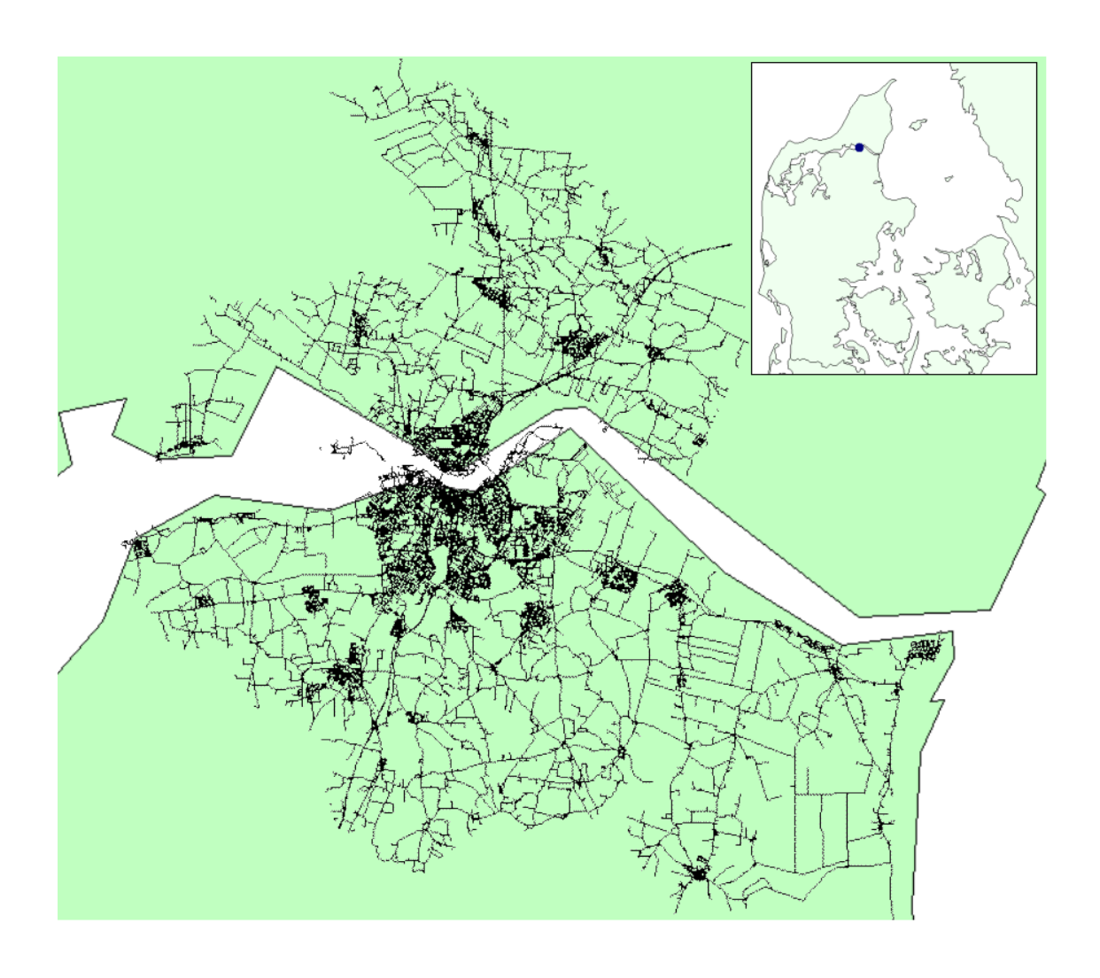
Figure 4: Road Map

digital road network. This has led us to making some modifications of the road network data for some of the most-used roads. We have also split some segments that spanned more than two intersections. This was done in order to ensure that each road segment is delimited by two consecutive road intersections. The modified road network is stored in the file road_modified.dat and has the same format as file road.dat . Note that here, the last two digits of x_coord and y_coord are rounded.